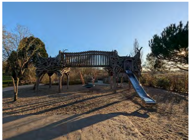
Bridge and slide in the Back to Nature Garden, taken out of hours

From responses to our most recent Annual Members' survey, where we asked members if they visit RHS Gardens with children and if so what features are important to them, it was very clear that play areas are a key priority. Over 30% of the members who responded said that they visit our gardens with children, and the play areas were the second most important feature for them when they visit – 73.2% of visitors said that the outdoor/natural play area was important to them (which is up from 69% in 2024).