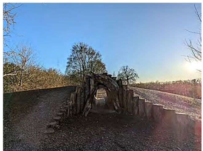
Play tunnel, Back to Nature Garden, taken out of hours

Since we reported in 2021 we have had a consistent increase in visitors, including children, since the end of the pandemic. The slight downturn in 2023/4 reflects the start of the roadworks around the garden, which as you may be aware from our recent campaign, significantly impacted on our visitors at the end of 2023 and throughout 2024. We are already starting to see a reversal in this trend with a combination of targeted campaigns and marketing and the return of our previously faithful visitors and members.