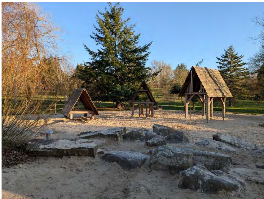
Stilt Houses in the Back to Nature Garden, take out of hours

Please note that images for this report were taken out of hours to ensure recent photos and avoiding the need for permission from any children and individuals caught in the images. They in no way reflect the popularity of the play area.