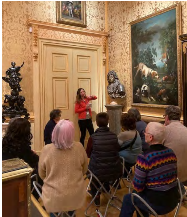
Participants at Describe and Draw

Everyone was friendly, helpful and encouraging. I enjoyed the history and the information on how the sculptures were made. The descriptions were excellent and it was great that we were able to ask questions to gain further insights.