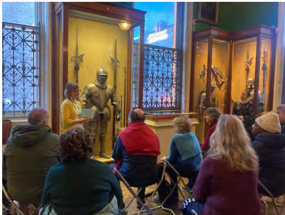
Describe and Touch, December 2022