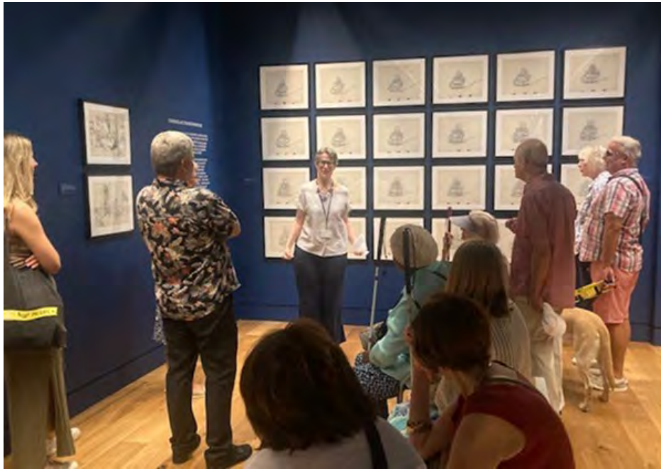
Audio-described introduction to Inspiring Walt Disney , August 2022