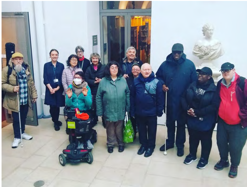
Participants in the focus group for blind and partially sighted people