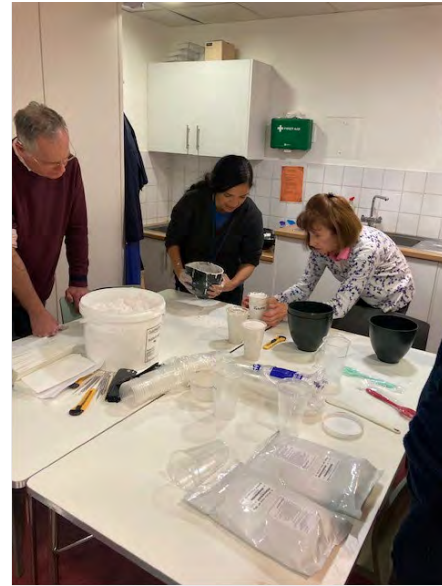
Participants in a British Sign Language workshop, February 2023

At the Wallace Collection, equality, diversity and inclusion are values that guide all of our work. Through our access programme — designed for people who may face barriers to participation in museums — we invite diverse audiences to engage with the Collection’s extraordinary artworks. As you will read in this report, the programme consists of events both onsite and online as well as digital resources. Among our offerings are ‘relaxed mornings,’ in which we offer particular groups exclusive access to the Collection or a special exhibition for a few dedicated hours. All of these relaxed, friendly events are delivered by our learning team and underpinned by robust learning pedagogy.