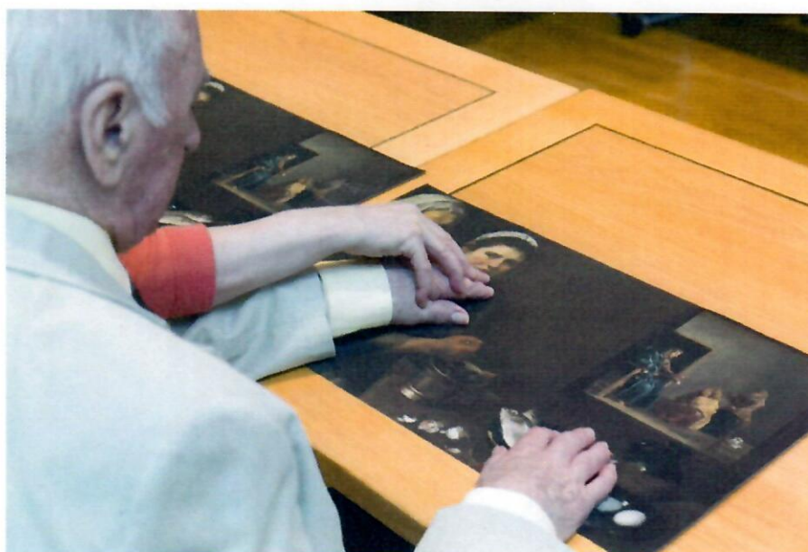
A participant in an Art through Words session exploring a tactile image

Descriptive Folders are available at the Information Desk for use by blind and partially sighted visitors. Each folder focuses on two highlight paintings and includes descriptive text and interpretation of the paintings in either large print or Braille. In addition, the folders include photographic reproductions showing close-up sections of the painting for partially sighted visitors and tactile images for those who are blind.